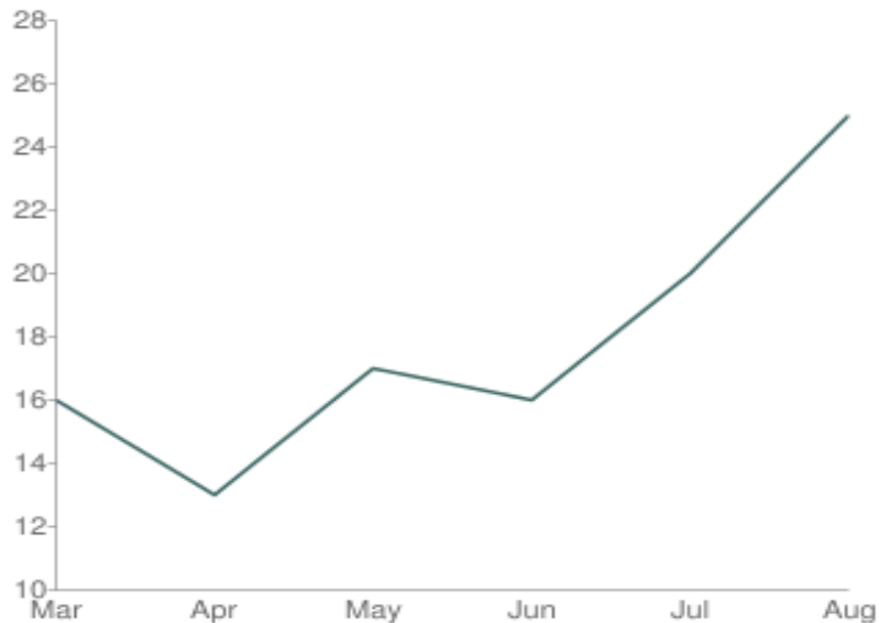
AVERAGE DAYS ON MARKET