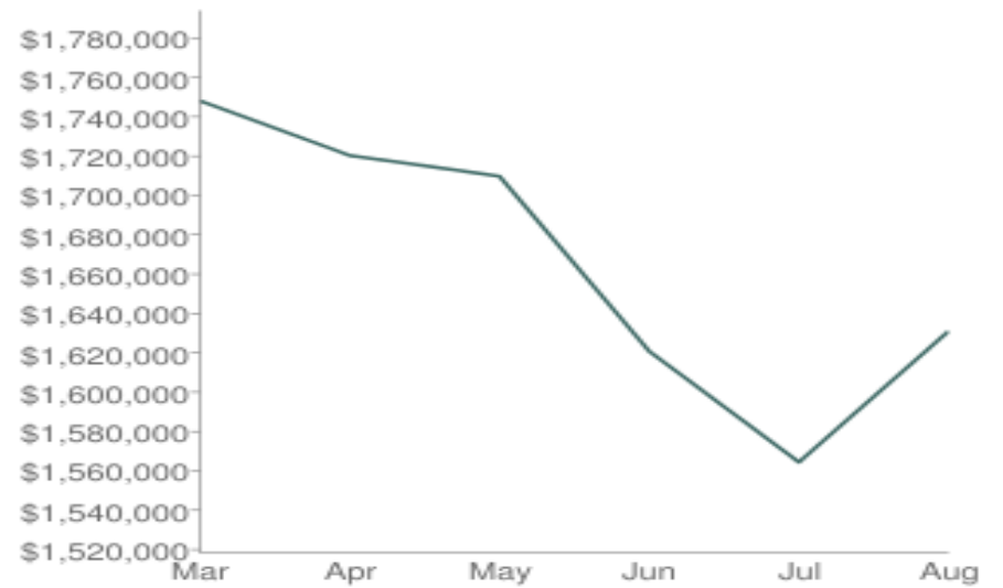
AVERAGE SALES PRICE